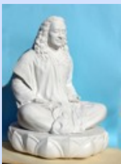
Murti of Yoganandaji made in Italy of Carrera marble resin with lotus base Cost: Rs. 1.6 lakh