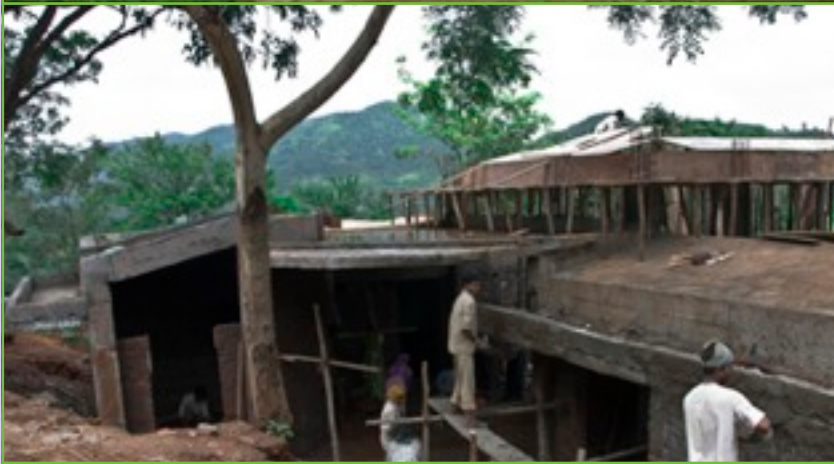
View from the back side of Swamiji's house