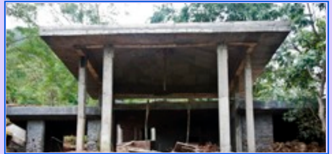
and outside living room view