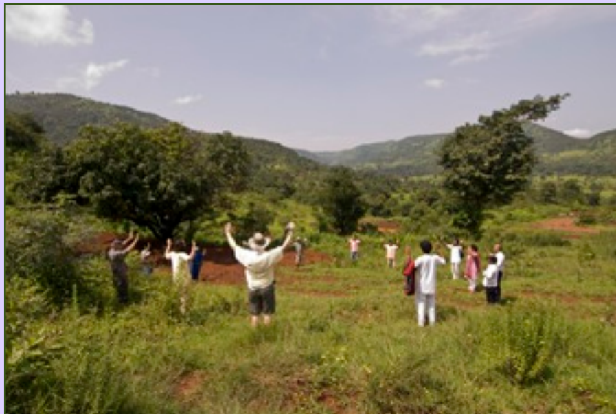
Dharmadas and Nirmala lead a group blessing at the site of the new interim Temple of Light