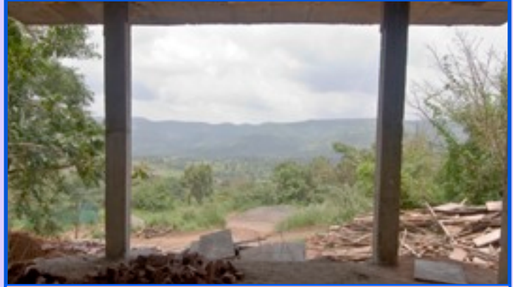
View from Swamiji's living room window