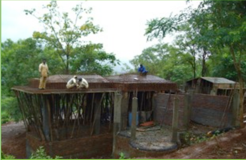
From the left: Swamiji's office, bedroom, and entry.